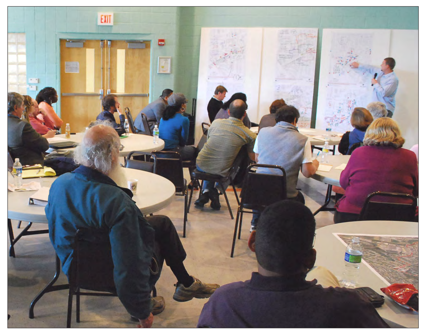
Community members present ideas at the October 31, 2009, hands-on community design session.

A critical component of creating a successful, sustainable development plan is ensuring an open and inclusive public participation process. Broad and active community engagement involves the public in plan making from the early stages of determining issues and assets, through visioning, to final plan formulation. This planning process invited community residents, business owners, and government officials to share their ideas. The aspirations of all segments of the community are incorporated into a shared vision for the future.