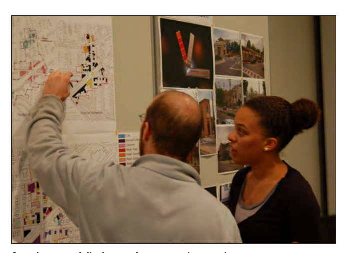
Open house and displays at the community meeting on November 10, 2009.