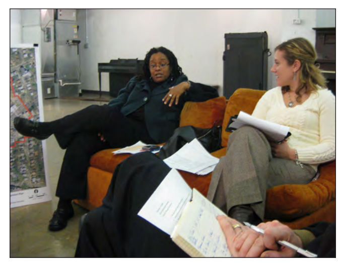
December 15, 2009, artists stakeholder feedback session.