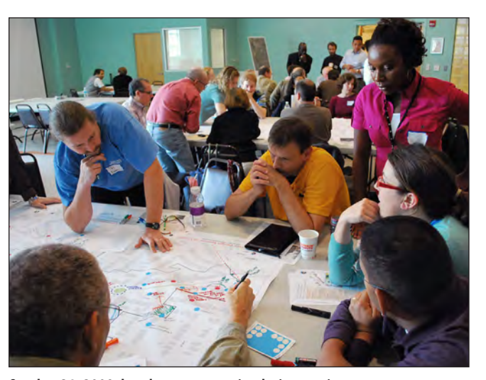
October 31, 2009, hands-on community design session.

Community Workshop—Presentation of Design Guidelines and Standards March 23, 2010