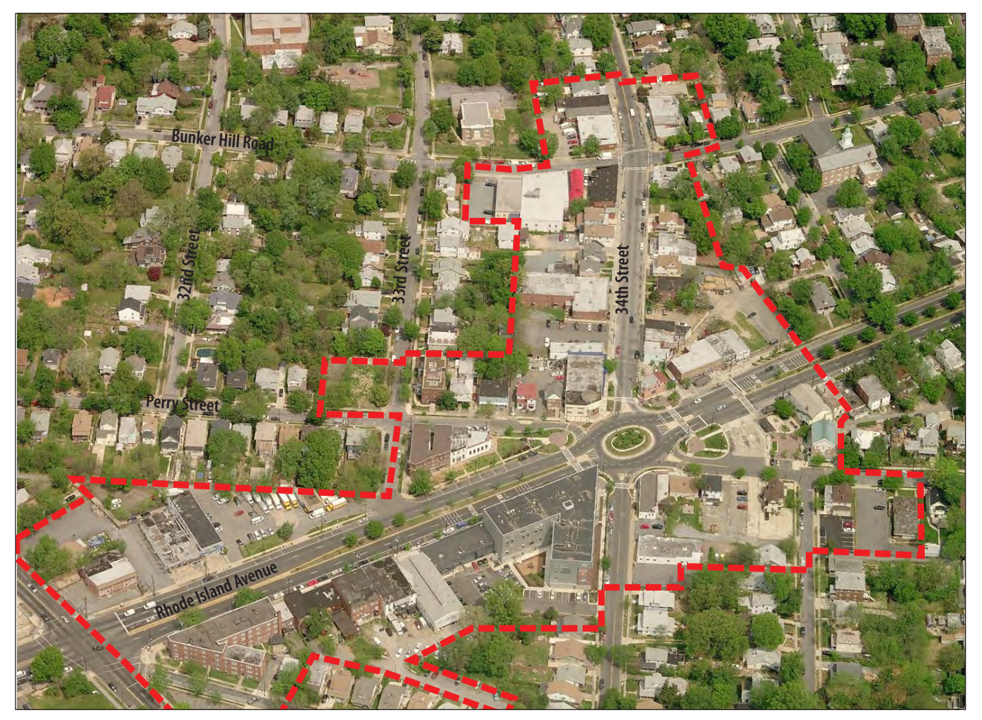
An aerial photograph of the Mount Rainier M-U-TC Zone.

The project area encompasses all parcels along the Rhode Island Avenue corridor east of the District of Columbia line at Eastern Avenue to just beyond the traffic circle at 34th Street. It includes the building frontages along 34th Street just north of Bunker Hill Road to about an eighth of a block south of Rhode Island Avenue. The 2004 Approved Sector Plan and Sectional Map Amendment for the Prince George's County Gateway Arts District amended the 1994 M-U-TC boundary. This development plan uses the amended M-U-TC boundary. (See the aerial photograph and outline below.)